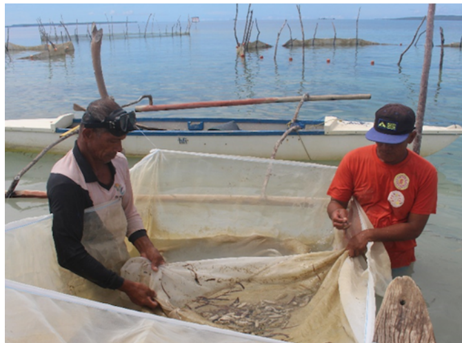
Fig 3. Community members helping in monitoring the juveniles in ocean nursery.

The MMA, being the partner organization in the community has always been at the forefront of the overall management of the sea ranch. While the researchers made decisions on the technical aspects involving the research operation, the MMA was the lead on the community aspect of the sea ranch operation. Assignment of guarding duties and division of labor were decided by the MMA members.