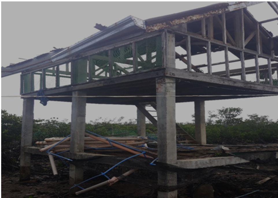
Fig 7. Damaged guard house after a typhoon hits the island.