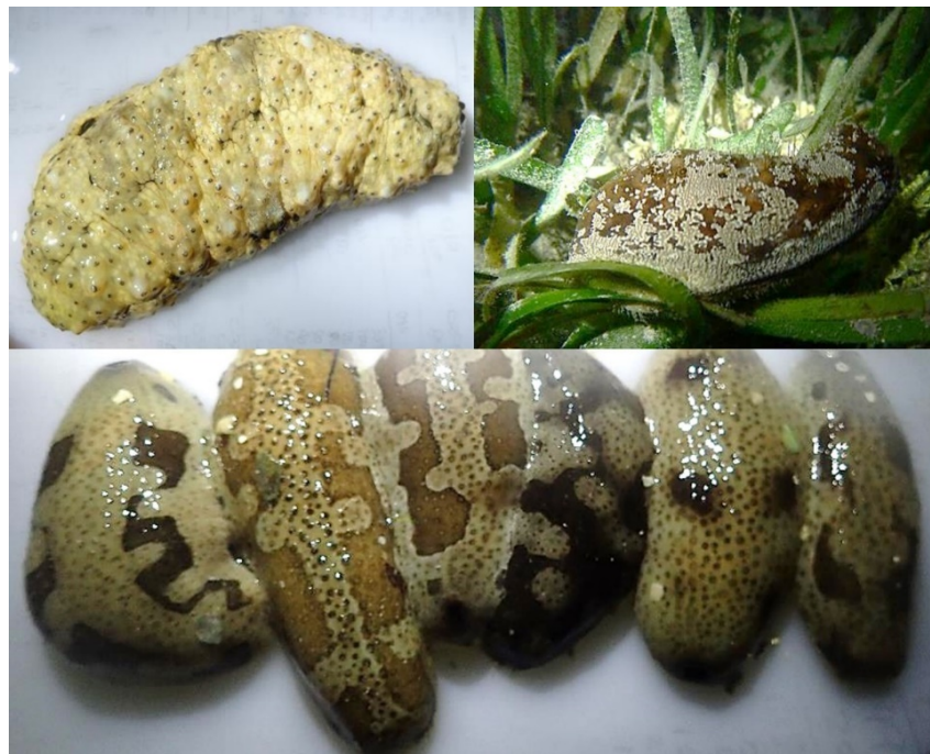
Fig 5. Some of the commercially valuable sea cucumber species are believed to be recruited after the establishment of the sandfish sea ranch. These were collected during a nighttime sea ranch monitoring (Top Left: Stichopus sp., Top Right: Actinophyga sp.; Bottom: various species of Bohadschia ).

Moreover, stocking activities and protection of the sea ranch resulted in the recruitment of other sea cucumber species (Figure 5) such as pulutan ( Bohadschia marmorata ), puron ( Actinophyga echinitis ), ulnitan ( Holothuria fuscoscinnaria ). Seagrass growth was dense in areas where there were sandfish while less dense in regularly gleaned areas, an observation shared by a key informant. Furthermore, appropriate boundary delineation of the 5-hectare sea ranch allowed the area respite from fishing, gleaned, and other anthropogenic disturbances. As claimed by one local fisherman, fishers entering the area were controlled because community members regulated the kind of fishing allowed in their area. For instance, fishers who use double nets cannot easily enter their area which allowed fish and other species to thrive. A respondent claimed that the sea ranch functioned as an MPA, where all species present were protected from poachers thereby enhancing coastal resources and biodiversity. However, this claim is not supported by empirical data.