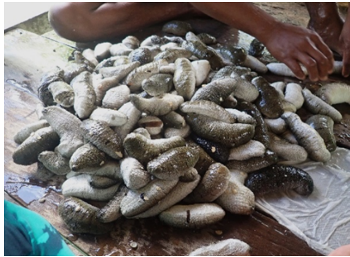
Fig 4. Sandfish collected from the coastal area of Maliwaliw Island, indicative of an increased sandfish abundance in the area.

sandfish mariculture in Maliwaliw, therefore, has resulted in the recruitment and improvement of sandfish wild stock in the area (see Figure 4).