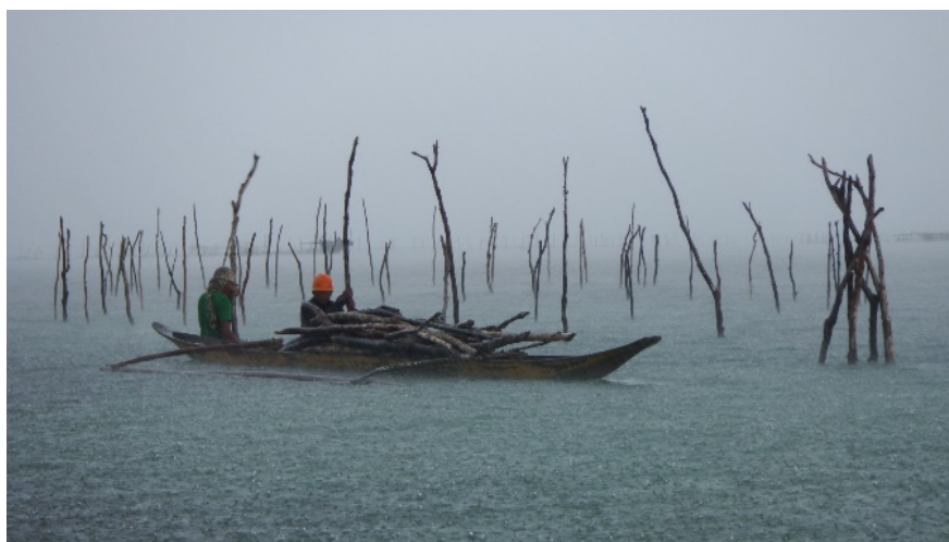
Fig 2. Community members during the construction of grow-out pens.

The Maliwaliw BLGU also supported the activities of the project most especially in the project monitoring and apprehensions of poachers in the sea ranch. During apprehensions, the sea ranch guards would seek help from the barangay tanod (village guards) and bantay dagat (sea warden) from the community.