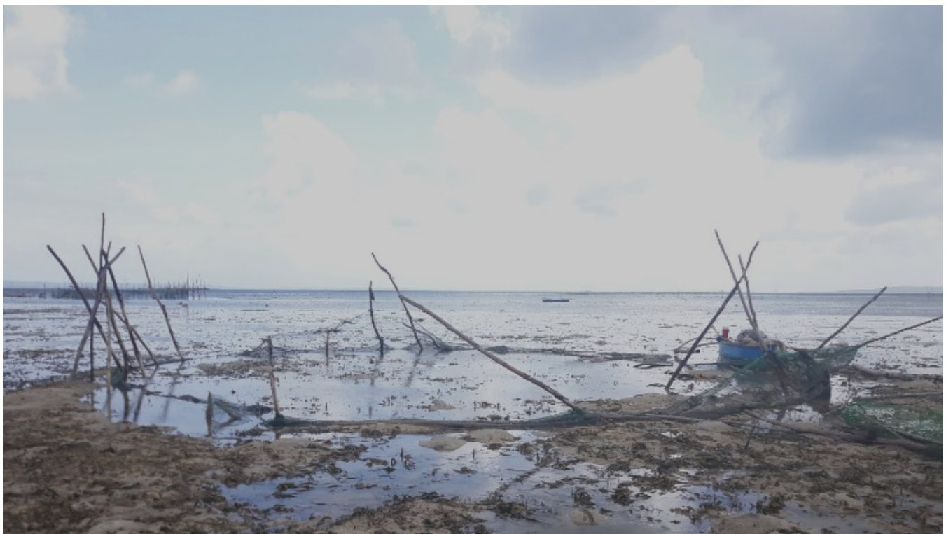
Fig 6. Damaged sandfish grow-out pen after a typhoon hit the island.

Mariculture operations of any type are vulnerable to climate challenges (Salayo et al., 2012). In the Philippines, the geographic location of Eastern Samar makes it one of the most frequently visited provinces by typhoons and other severe weather disturbances. This has put the future of mariculture at high risk. Like any other kind of mariculture activity, sandfish grow-out pens may be washed out by typhoons (Figure 6). In some instances, sea cucumbers were observed to be floating after a strong typhoon. Smaller sandfish were also observed to be affected by continuous heavy rains. For instance, small sandfish which preferred to inhabit near the mangrove were observed to die after a week of heavy rains. During these natural disturbances, not only sandfish survival is affected but also the sea ranching infrastructures such as guard houses (Figure 7), and pens. Without an insurance system in place, rebuilding the ranch infrastructures may be difficult for small-scale fishers.